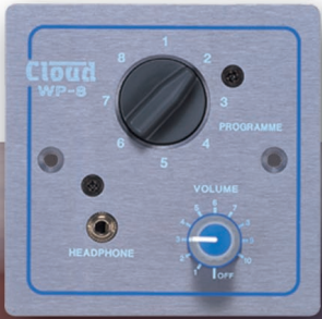
WP-8 wall plate