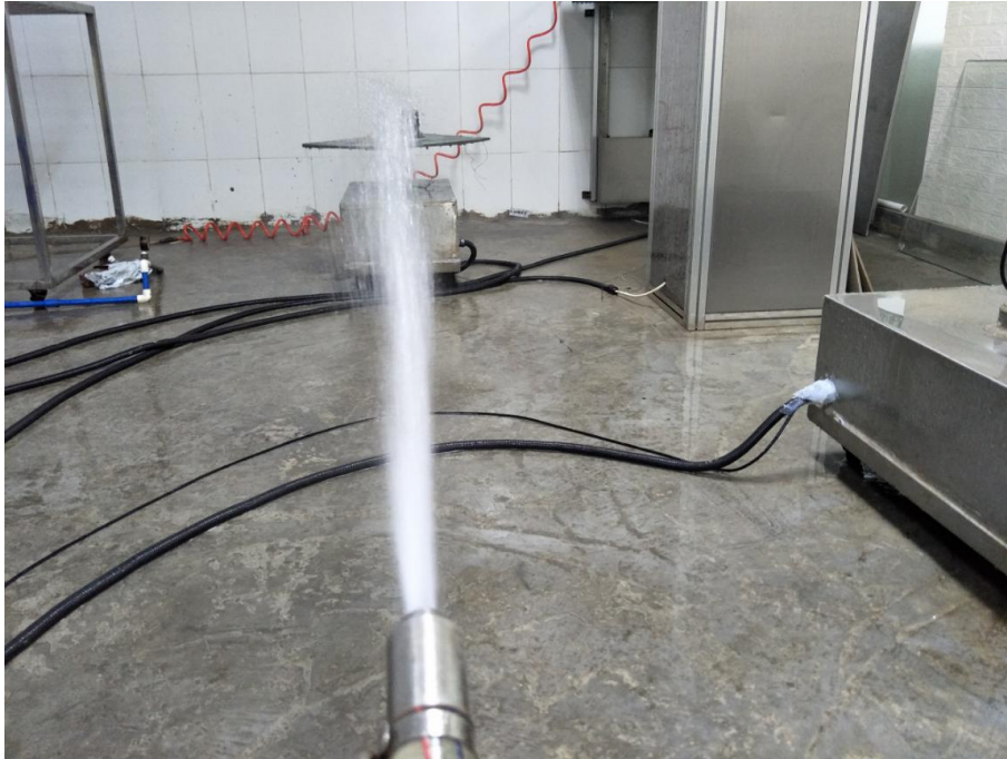
Fig. 3 The Waterproof Test /防水测试