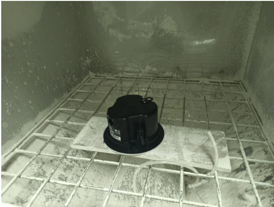
Fig. 2 The Dustproof Test /防尘测试