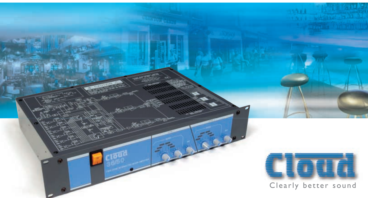
36/50 Integrated Two Zone Plus Utility Mixer Amplifier