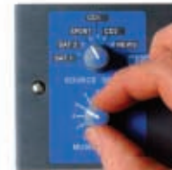
Remote source select and level control (RSL-6)

source/level control plates. Zone 1 and zone 2 have rear panel mounted switches that allow them to operate with local control or remote control and if appropriate, internal jumpers allow the use of a remote level control (RL-1) with front panel source select. When using the remote control function, the operation of the respective front panel control is defeated. The RSL-6 is connected to the mixer using two-core cable with screen. The microphone levels are not controlled by the remote control facilities.